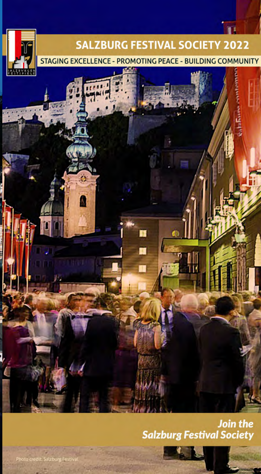
Performance of Jedermann at the Domplatz

The Salzburg Festival Society 509 Madison Avenue, PH New York, NY 10022 office@sfsociety.org 212-355-5675