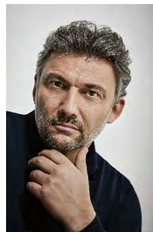
Jonas Kaufmann