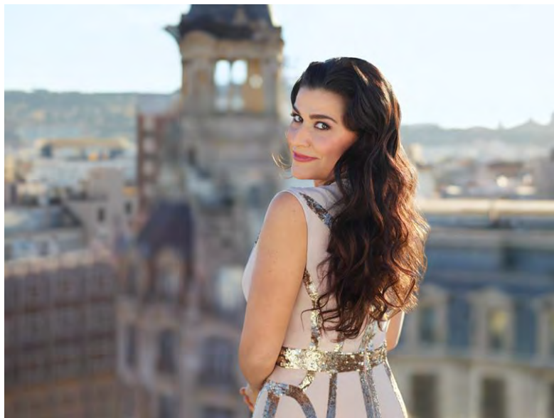
Cecilia Bartoli

I would like to pay homage to Rome, my beloved hometown. For 150 years Rome has been the capital of modern Italy and has retained its contradictory identities, of proud splendour on the one hand and decadence and decay on the other. Through all times, the city has remained true to its trademark, losing none of its potency and allure as the Eternal City.