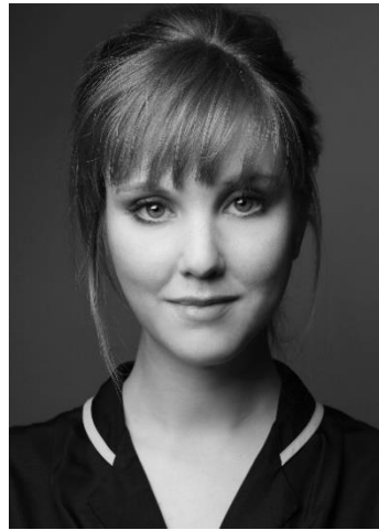
Mélissa Petit