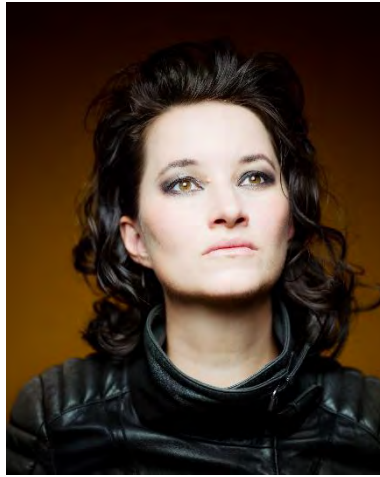
Anna Prohaska