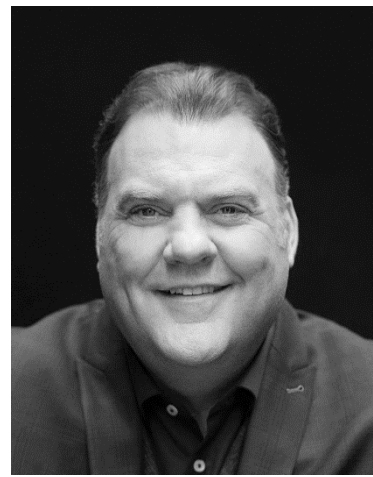
Bryn Terfel