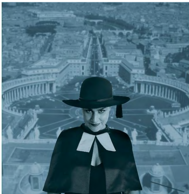
Cecilia Bartoli

Listen to Cecilia Bartoli sing “Lascia la spina, cogli la rosa” from G. F. Handel’s Il trionfo del Tempo e del Disinganno https://www.salzburgerfestspiele.at/presse/audio