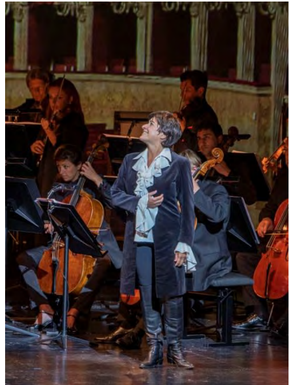
Cecilia Bartoli in Salzburg in August 2020

frisson of being in touch with history when leafing through the autograph manuscript of Bellini's Norma at the Santa Cecilia library, when first meeting living members of the Pamphilj family, when singing at a church located literally in the Forum Romanum, or when I became the first woman to work with the Sistine Chapel Choir. Finally, I began to understand why so many of our greatest artists longed to visit Rome, and why the city inspired them to create their masterworks.