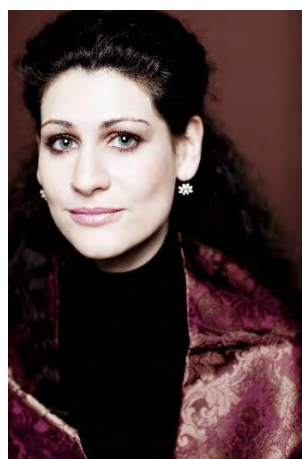
Anja Harteros