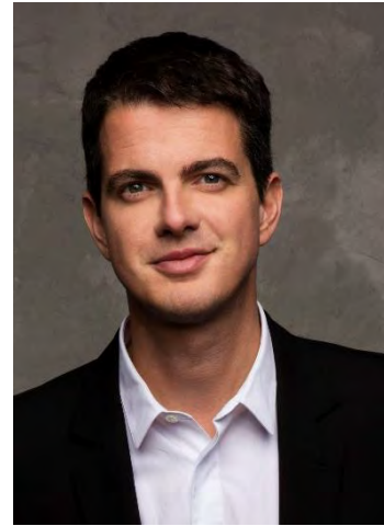
Philippe Jaroussky

Puccini's Tosca is linked to Rome like few other operas. You will be singing the role of the Pastorello, which you first performed at the Opera in Rome when you were ten. How do you remember that performance, and how does it feel to once again take on this role?