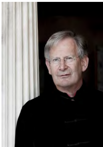
John Eliot Gardiner