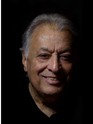
Zubin Mehta